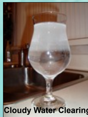
Cloudy Water Clearing