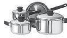
Kitchen Cookware Metal pots, pans, tins & utensils