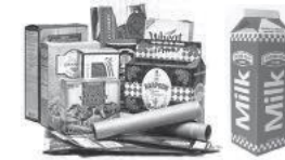
Paperboard, Milk & Juice Cartons No wax coated paperboard