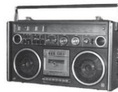
Electronics Recycling Center Only