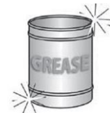
Kitchen Oils Recycling Center Only