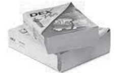
Phone Books All types and sizes