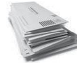
Junk Mail Envelopes, flyers, brochures postcards