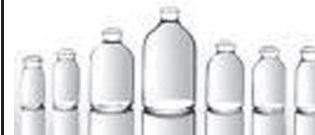
Clear Glass Empty, clear glass only