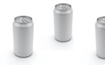
Aluminum Cans Empty cans only