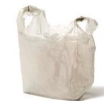
Plastic Bags Retail & grocery bags