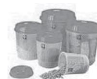
Household Plastic (#3 - #7) Empty containers only