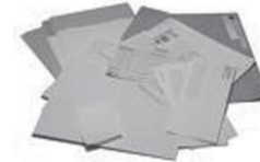
Office Paper All types and sizes