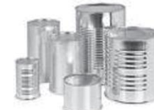
Steel & Tin Cans Empty cans only