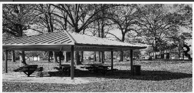
Thomas L. Butcher Park

Resident: $100 Non-resident: $125 Fee for a 6 hour rental