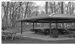
Frank J. Licht Park