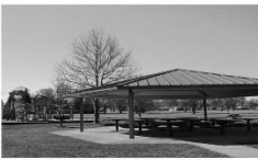
Arthur J. Miller Park