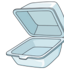
Styrofoam Containers and Packaging