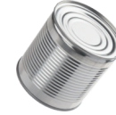
Steel and Tin Cans (empty cans only)