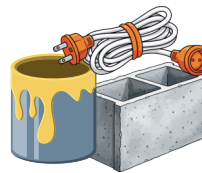
Other Items Electrical Cords, Paint Cans (dried out), Colored Glass, Wood Items, Concrete