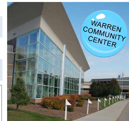
WARREN COMMUNITY CENTER